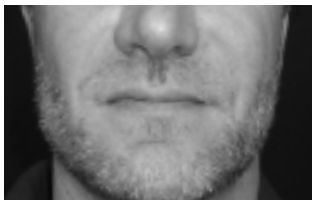
After 16 months