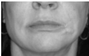
After 14 months

"I've tried other methods, but I wasn't able to achieve such a youthful look. This procedure really made all the difference."